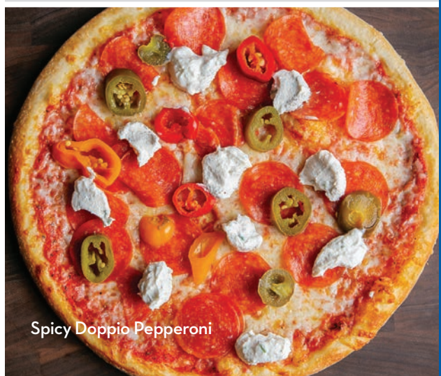
Spicy Doppio Pepperoni