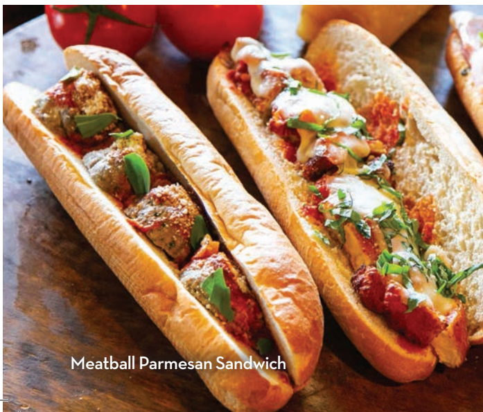
Meatball Parmesan Sandwich

Chicken sautéed with fresh spinach, Portobello mushrooms, garlic extra-virgin olive oil, and Wisconsin mozzarella cheese. 55