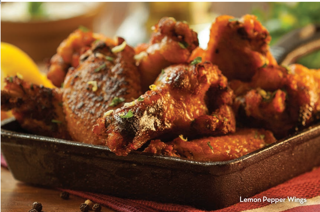
Lemon Pepper Wings