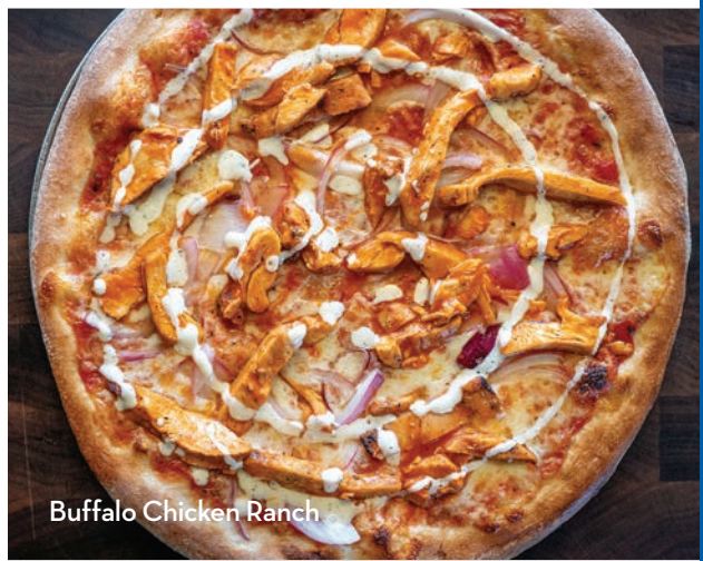
Buffalo Chicken Ranch