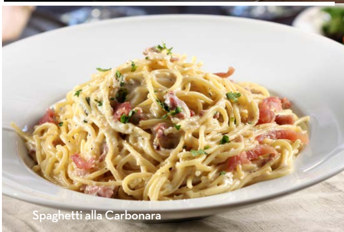
Spaghetti alla Carbonara