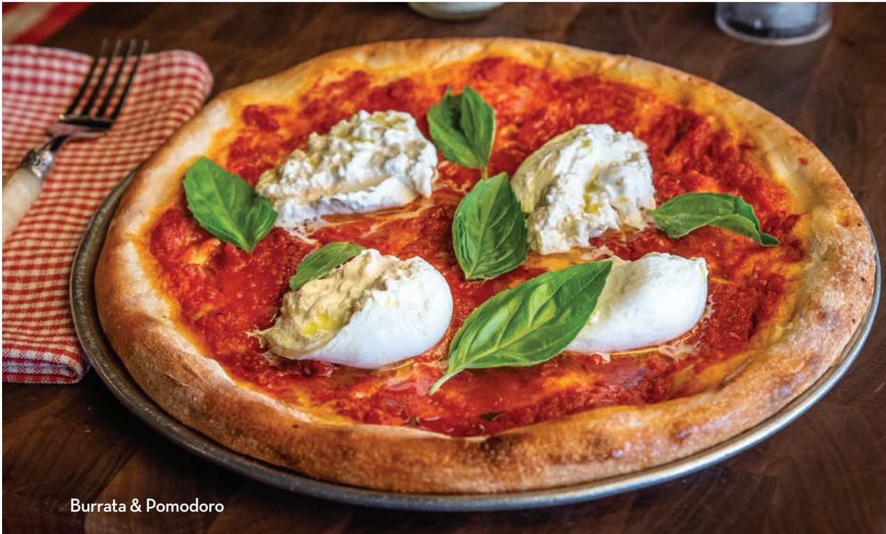
Burrata & Pomodoro