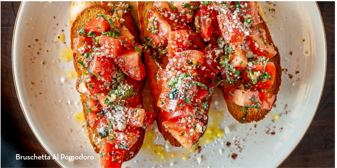
Bruschetta Al Pomodoro