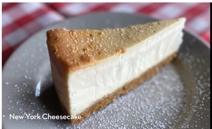
New York Cheesecake

Folded and baked calzone stuffed with Nutella chocolate and ricotta cheese. 35