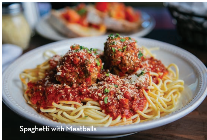
Spaghetti with Meatballs

All prices are in UAE Dirhams inclusive of VAT