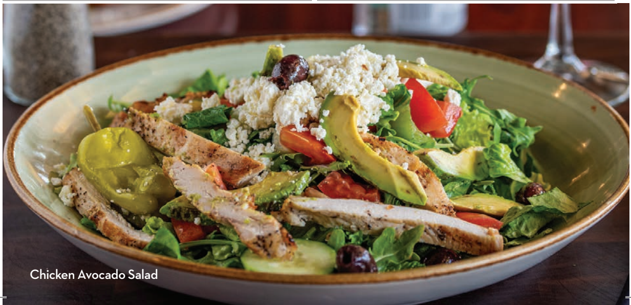
Chicken Avocado Salad