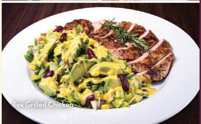
Tex Grilled Chicken

All prices are in UAE Dirhams inclusive of VAT