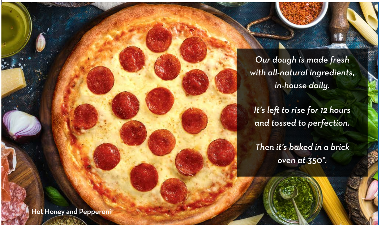
Hot Honey and Pepperoni

Our dough is made fresh with all-natural ingredients, in-house daily. It's left to rise for 12 hours and tossed to perfection. Then it's baked in a brick oven at 350°.