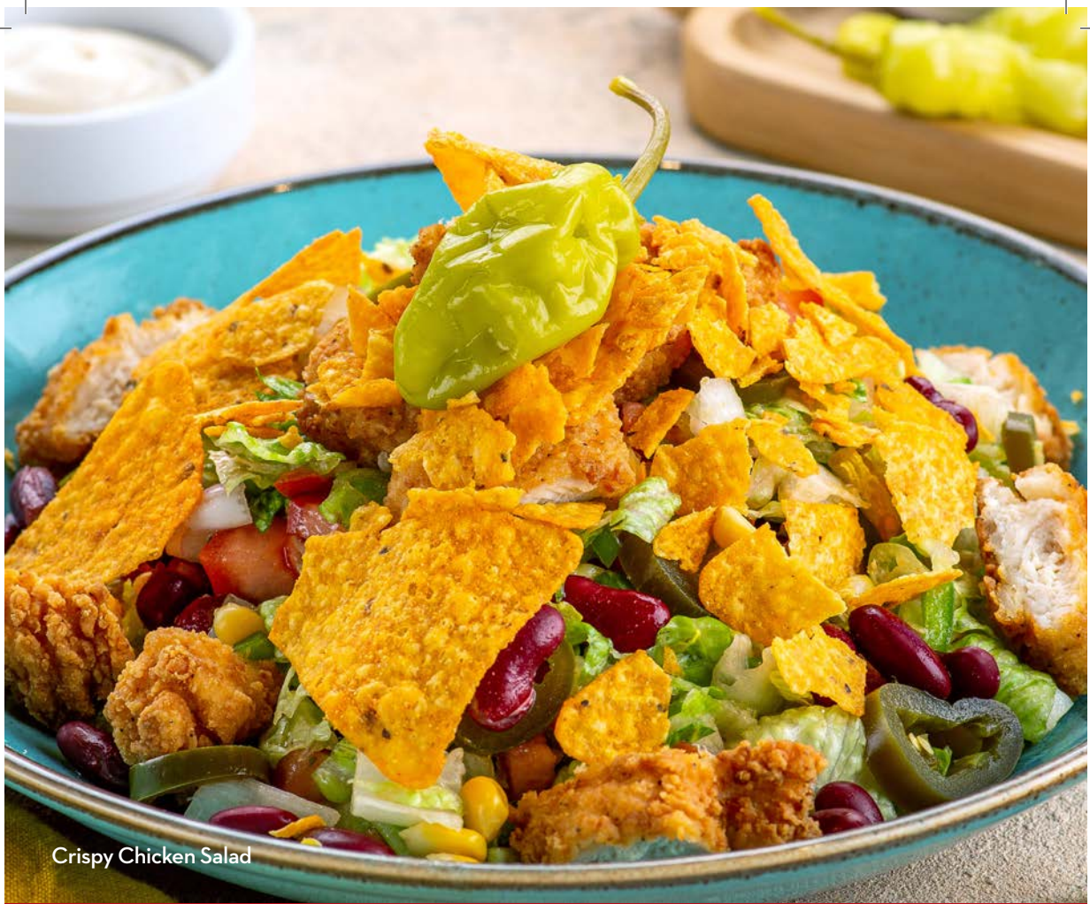
Crispy Chicken Salad

Russo's salad dressings are hand-prepared fresh daily and are MADE WITH AWARD-WINNING D.O.P. SICILIAN EXTRA-VIRGIN OLIVE OIL and the freshest premium ingredients.