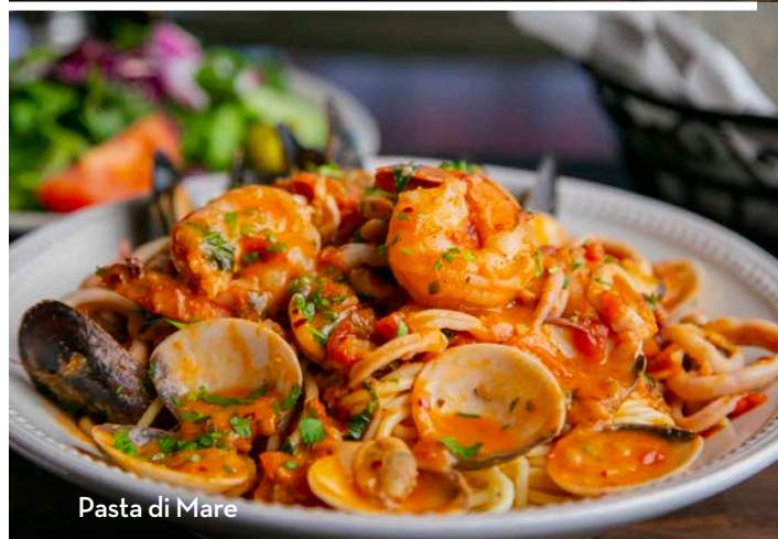
Pasta di Mare