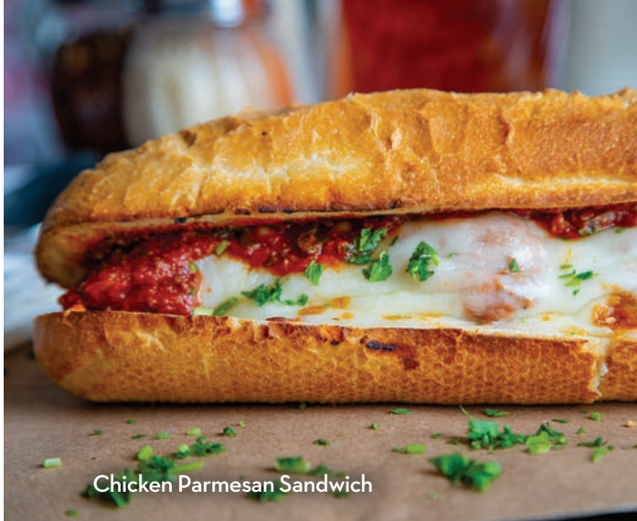
Chicken Parmesan Sandwich